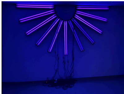
Paul Stephen Benjamin, Black Suns , 2023. Black light, Black power strip, Black extension cord.

Bemis Center for Contemporary Arts logo: EPS