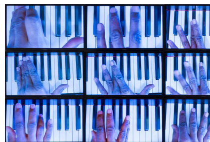
Paul Stephen Benjamin, detail of Sonata in Absolute Black , 2020. 36 Channel, Color, Sound, loop.